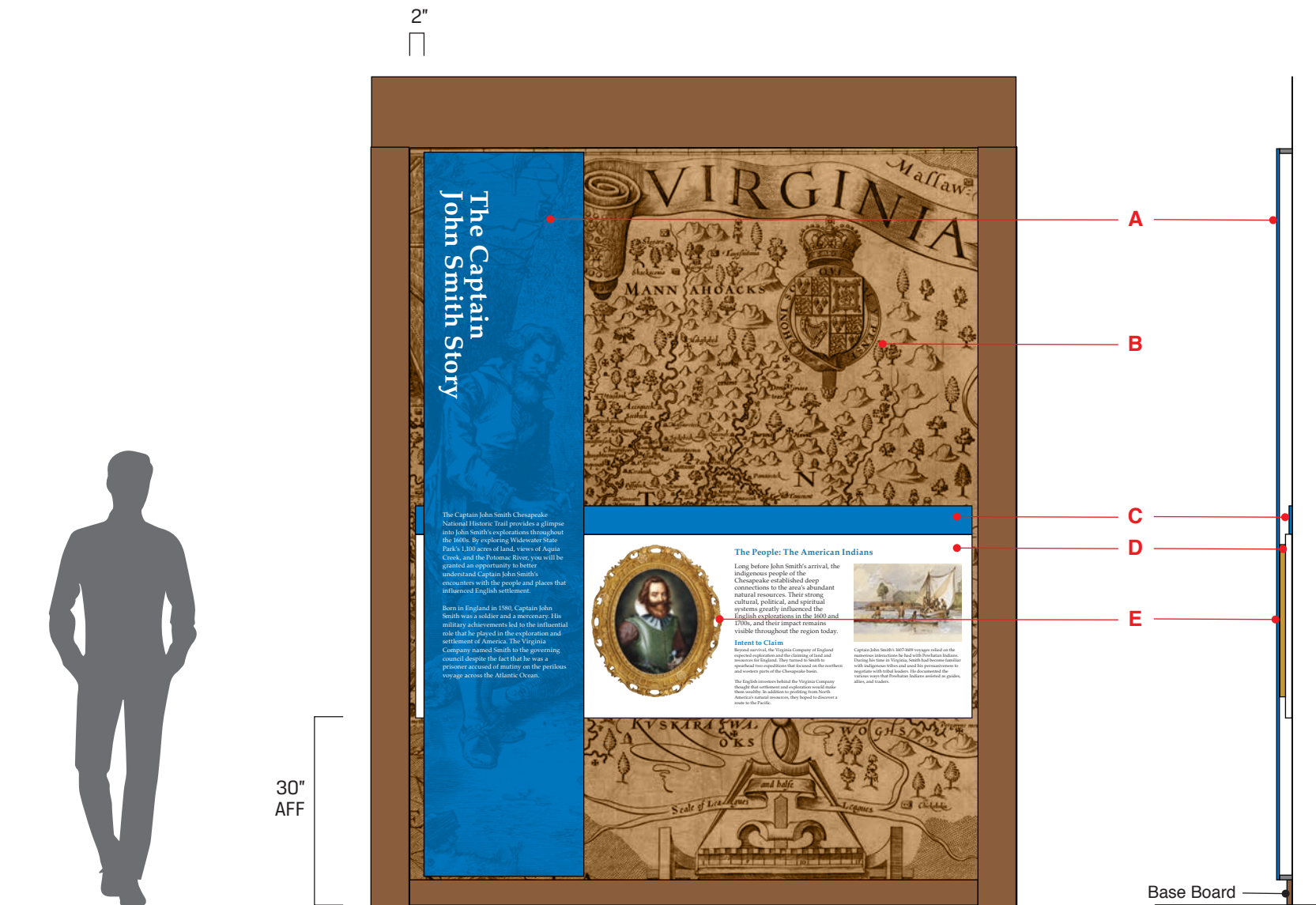
1 EXHIBIT BAY 1 Mounting Elevation SCALE: 1/2"=1'-0"